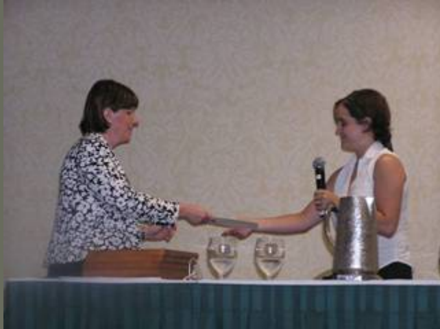
President Kite presents a contribution to the New Orleans Center for Creative Arts-Riverfront