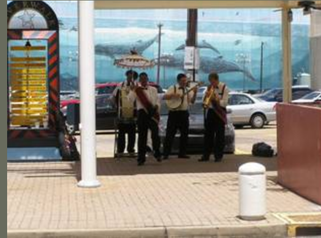
Street performers on the Riverwalk