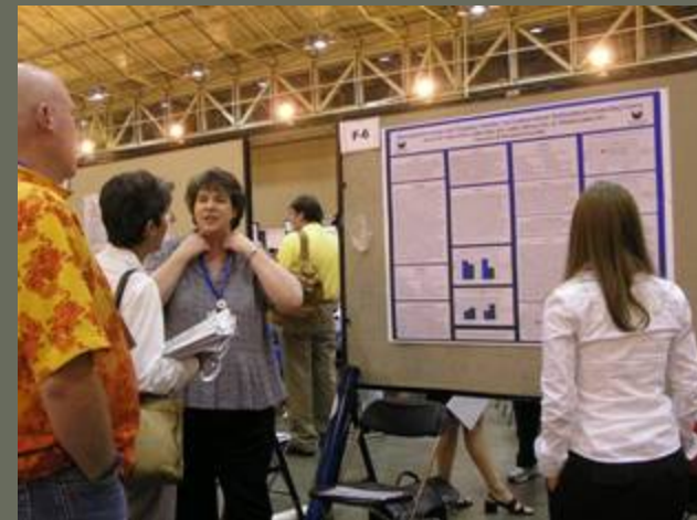
Participants at an STP Poster Session