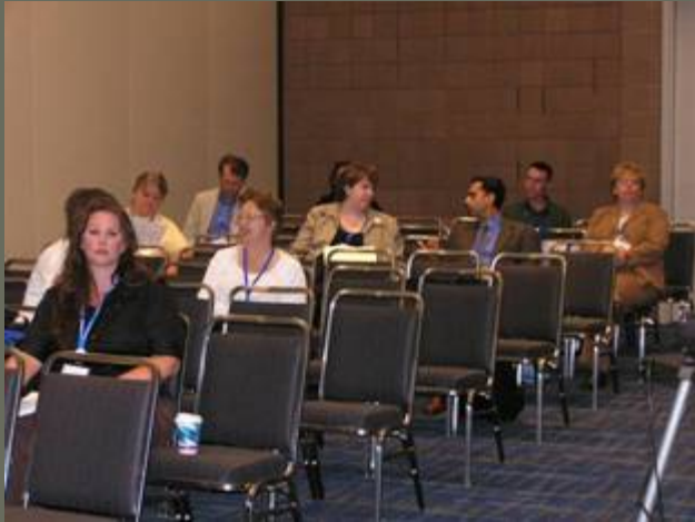
Participants await "The First Day of Class"