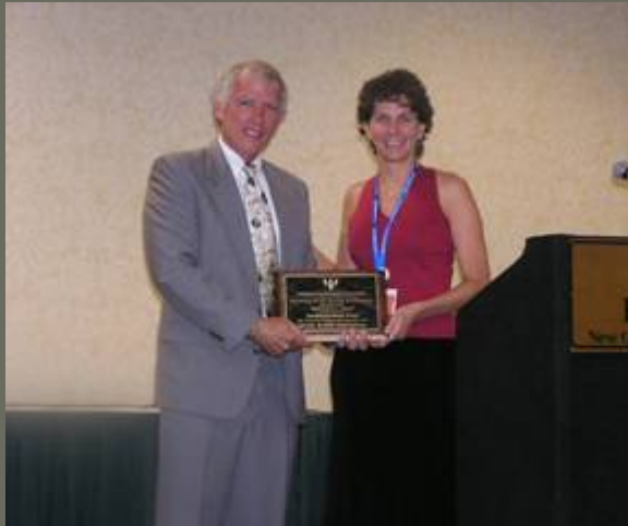
Dean Keith Simonton receives STP's Robert S. Daniel Teaching Award