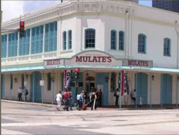
Mulate's was the site of the 2006 STP Dinner