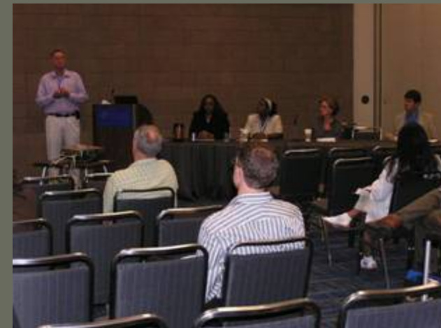
"Graduate Distance Education in Psychology: Adapting Best Practices"