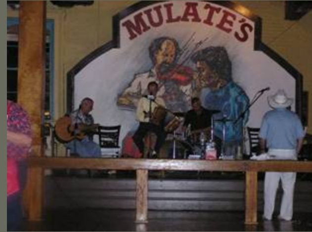
Live entertainment and dancing during the Dinner