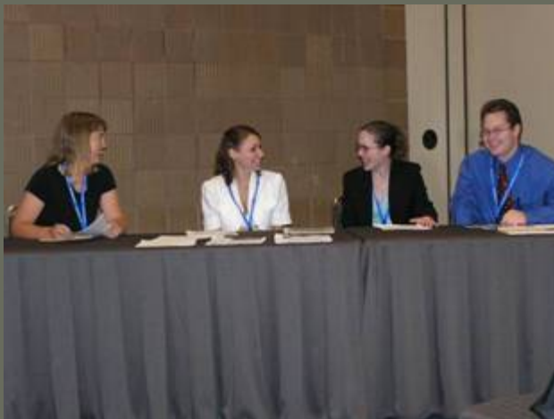
Panelists for "The IRB: Basics All Students (and Faculty) Should Know"