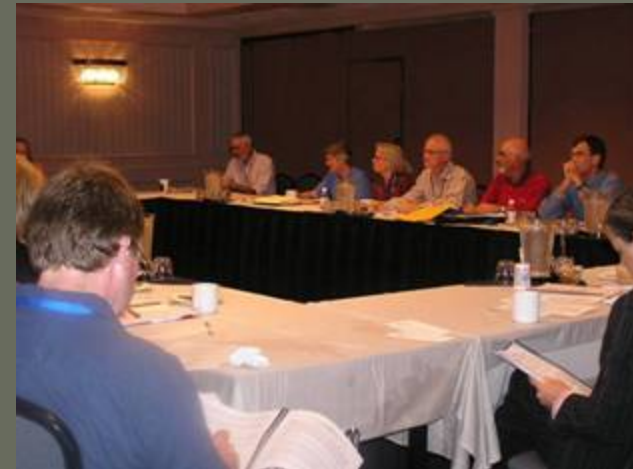
Discussion during the Executive Committee Meeting