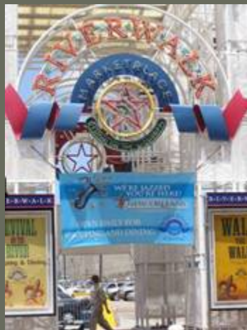
Entry to the New Orleans Riverwalk