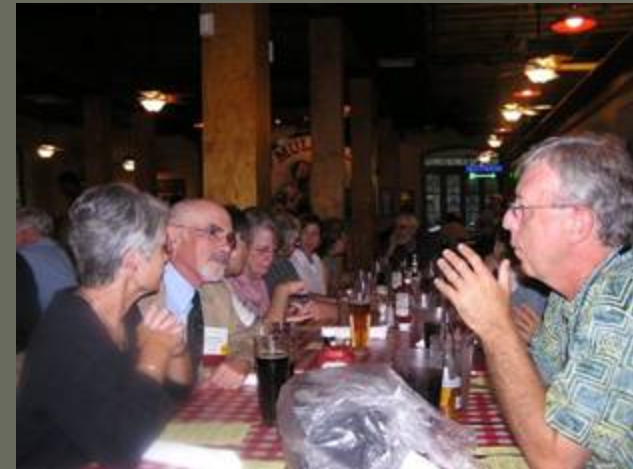
Guests at the 2006 STP Dinner