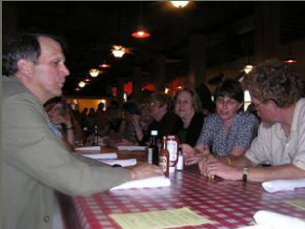
Guests at the 2006 STP Dinner